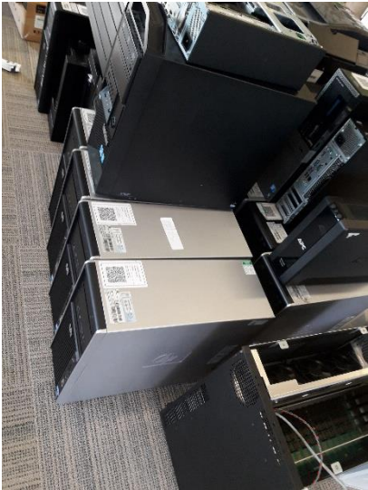
Desktop PC ×24